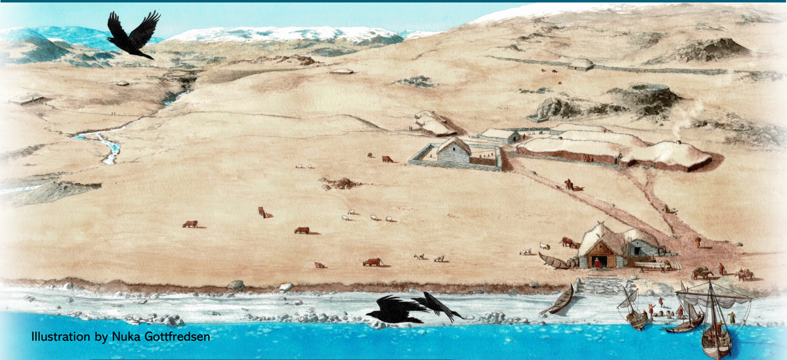
Illustration by Nuka Gottfredsen