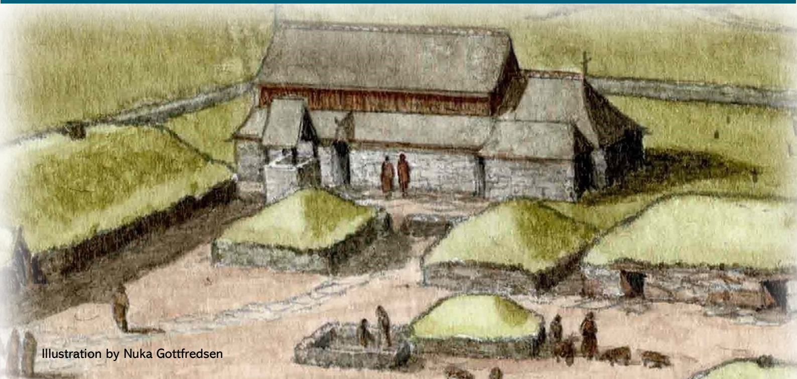
Illustration by Nuka Gottfredsen