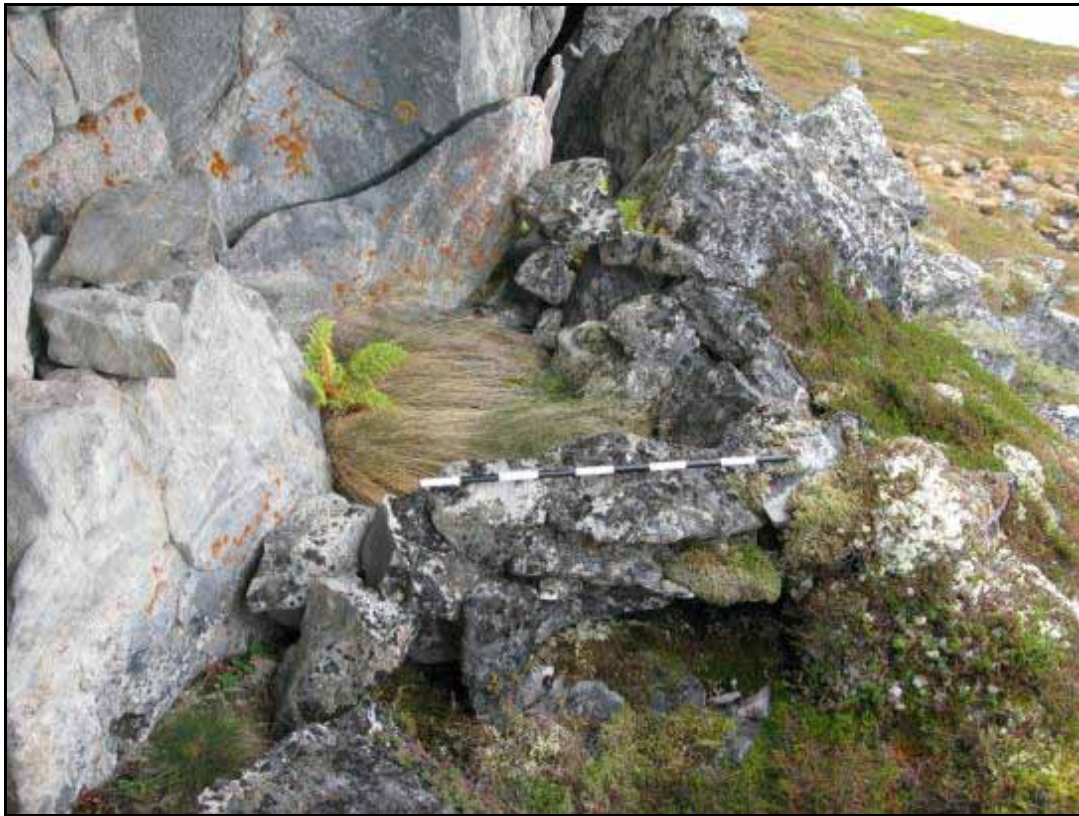
FM 63V2-III-38: Shelter built under a cliff overhang

FM 63V2-III-40: Part of a hunting drive for caribous. The system is situated along the river on the SE bank. The drive consist of 8 head sized or smaller stones placed on the cliff and some boulders. Position: N 63°01'59.8" / W 050°20'06.2" Position of the cairns making part of a drive: